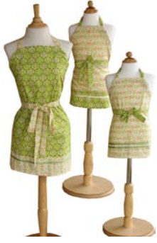
RD2015 Adjustable Aprons Adult + Child Sizes

11 projects featuring some of our most popular patterns