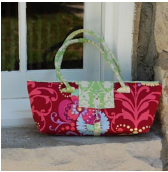
RD2025 The Flapper Purse