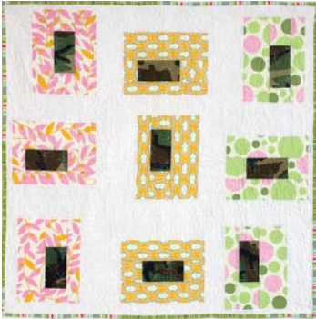
RD2031 Home Front Snuggler 60" x 60"

11 projects showcasing military uniforms and quilters cottons. Show your support!