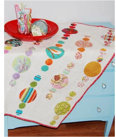
RD2026 Quarter and Dime Baby Size