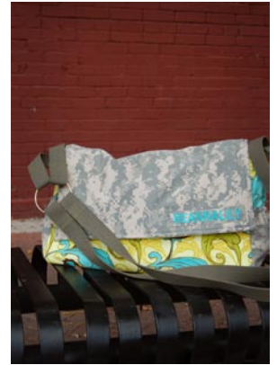
RD2029 Military Mailbag & Express Mailbag

Project assortment from: DEPLOY THAT FABRIC (book)