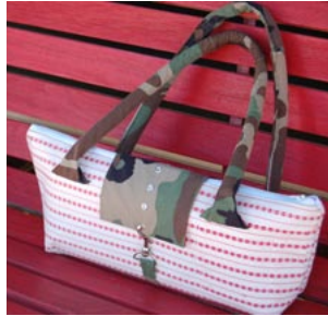
RD2025 The Flapper Purse