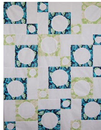
RD2021 Teddy Bear Circles 58" x 43" Baby Size 3 colorways available