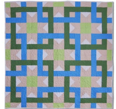
RD2001 Interlocking Squares Lap Size

*A NEW Quilter's Cotton Sample of RD2019 The Cube Purse is coming soon!