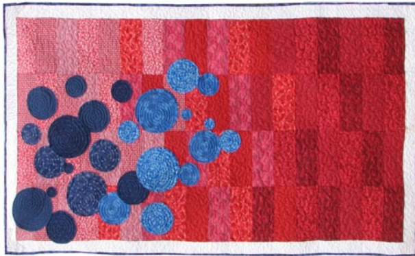
RD2013 Floating Bubbles Twin