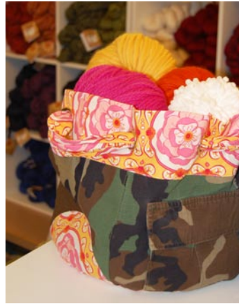
RD2030 All 'Round Tote