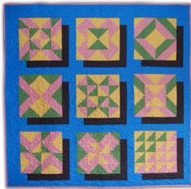
RD2002 Quick 3D Sampler 52" x 52"