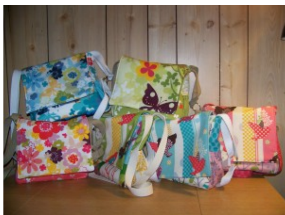
Express Mailbags made by Karen Morello- using a Layer Cake pre-cut bundle of fabric

The Express Mailbag is made from 10" squares or a layer cake. If you don't have a layer cake on hand, but wish to cut perfect 10" squares, check out the 10" square ruler sold here.